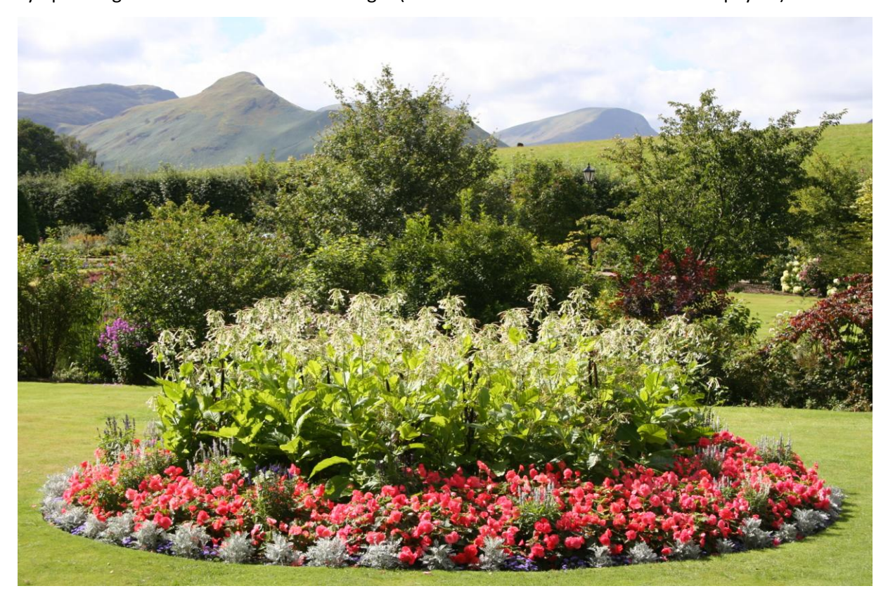
In the 2013 Business Plan consultation, 95% of adult respondents were satisfied with the provision within Hope Park.

Income is generated from the rental of the park's facilities and games, plus small donations. This income pays for the administration and maintenance of the park and provides a small fund for improvements. As such, Hope Park is currently operating at no cost to the Council budget (i.e. at no cost to Keswick's council tax payers).